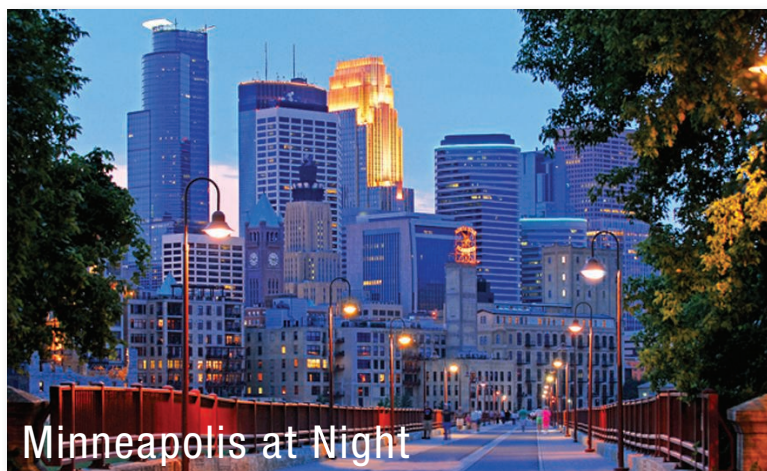
Minneapolis at Night